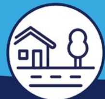
Limit your travel