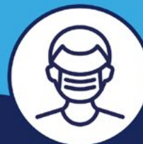
Cover your face (if less than 2 meters)