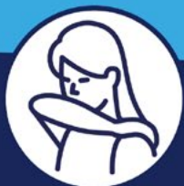
Cough into your sleeve