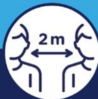
Keep your distance